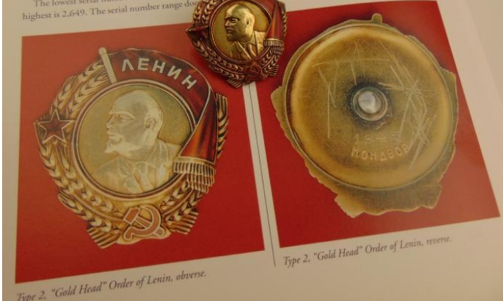
Type 2, "Gold Head" Order of Lenin, obverse.

The Type 4, "Platinum Head" Lenin, was awarded from June 11, 1936 until June 19, 1943. It incorporated an additional change to the Lenin profile. The "Platinum Head" Lenin was made from a separate piece of