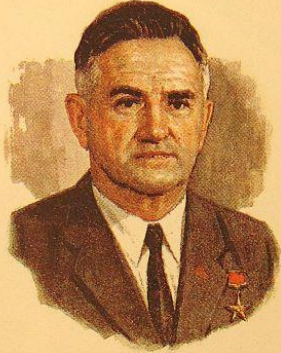
Советский авиаконструктор, Герой Социалистического Труда О. К. АНТОНОВ 1906 — 1984