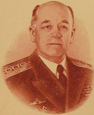
Советский радиотехник, академик АН СССР А. И. БЕРГ (1893—1979)