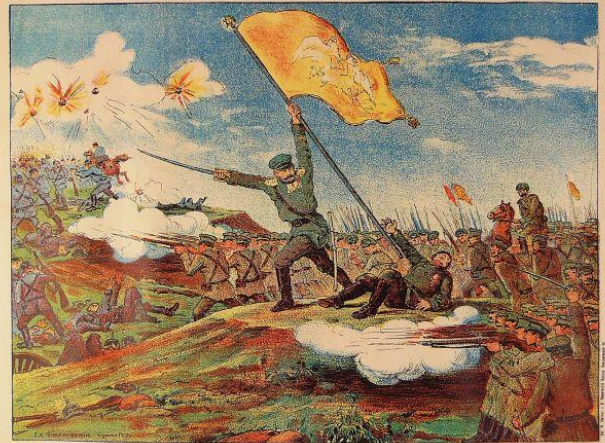
Лит. Ф. Шауръ и В. Смирновскій. Одесса. Прехоровская 44.