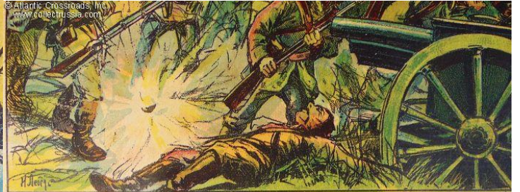
В 12 часов дня, после семидневного боя наша армия овладела передовыми сильно укрепленными позициями Львова, вынесенными на 15—20 верст к востоку от города, и приблизилась к главным львовским фортам. После крайне упорного боя 19 августа австрийцы бьжжали в беспорядке, бросив легкия и тяжелые орудия, артиллерийские парки и походный лагерь. Наши авангарды и конница пресл...