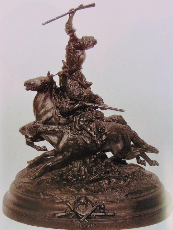
Джигитовка лезгин Кузнецкий завод 1960 г. 51 см. R2 Скульптор Лансере Е.А.