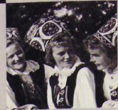
FRONT COVER: Estonian girls. — See story on page 10.

The magazine USSR is published by reciprocal agreement between the governments of the United States and the Soviet Union. The agreement provides for the publication and circulation of the magazine: USSR in the United States and the magazine Amerika in the Soviet Union.