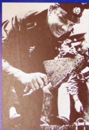
Закладка первого камня будущего