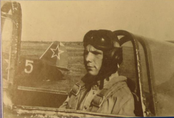
Отличные показатели у курсанта аэроклуба Ю.Гагарина