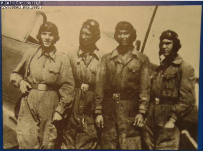
Ю.Гагарин с друзьями-курсантами аэроклуба на тренировочных полетах