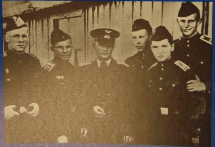
Ю.Гагарин среди курсантов военного училища