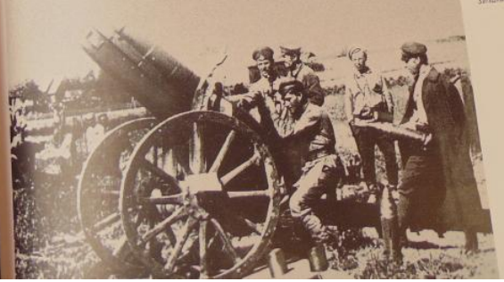
Артиллерия Красной Армии Западный фронт.