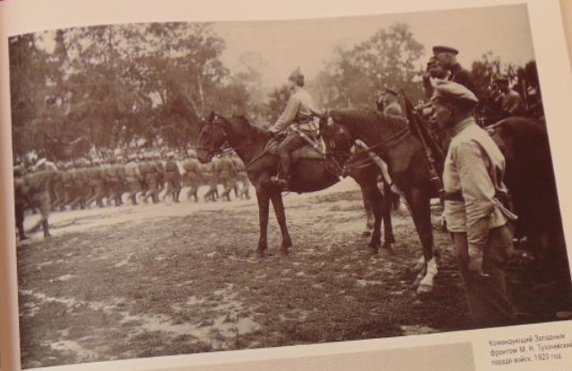
Кавалерийский Западным фронтом М. И. Тухачевский находясь вблизи 1920 года.