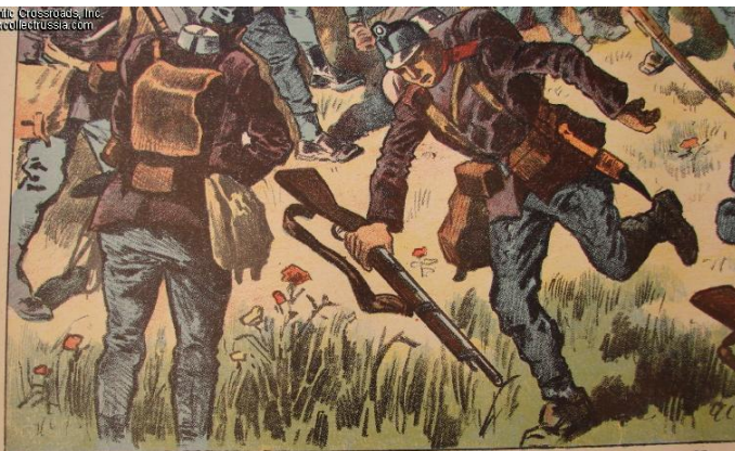
ПЕТРОГРАДЪ, 6 августа. Отъ генеральнаго штаба объявляется: 4-го августа, въ 12 часовъ дня, австрійская дивизія подошла къ линіи Городонъ-Нузъминъ. Наша конница завязала съ противникомъ бой у Городна, длившійся 5 часовъ. Огнемъ и конскими ата-