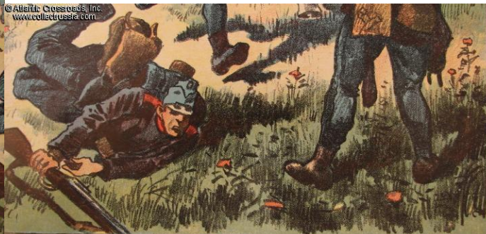
нами противнику нанесенъ уронъ. Все поле усыяно неприятельскими трупами. Наши потери незначительны. Около 7 часовъ вечера того же числа разстроенная австрійская дивизія отошла, преслѣдуемая нашей конницей.