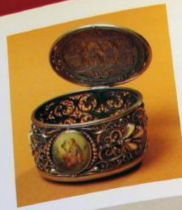
176 Fedoskino lacquerware with ornamental painting