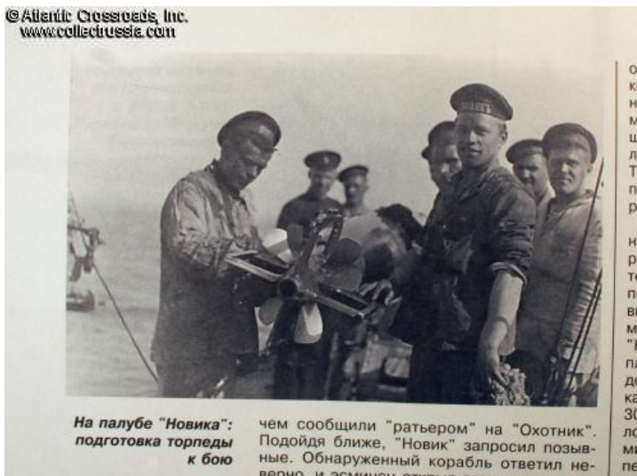
На палубе "Новика": подготовка торпеды к бою

чем сообщили "ратьером" на "Охотник". Подойдя ближе, "Новик" запросил позывные. Обнаруженный корабль ответил неверно, и эсминцы отступили.