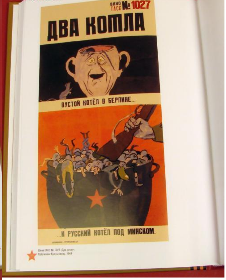
Одея ТАСС № 1027 «Два котла» Художник Курчавский. 1944