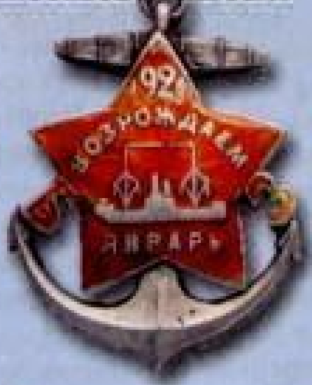
57. Знак за отличия, проявленные при возрождении Балтийского завода. 1925 г.